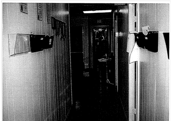
1. Second floor Code Enforcement southside offices.